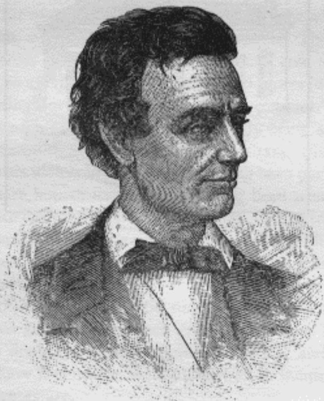
LINCOLN IN 1842

AN . ADDRESS . DELIVERED . BY ABRAHAM LINCOLN BEFORE . SPRINGFIELD . WASHINGTONIAN TEMPERANCE . SOCIETY . AT . THE SECOND . PRESBYTERIAN . CHURCH SPRINGFIELD . ILLINOIS . ON . THE 22d . DAY . OF . FEBRUARY . 1842